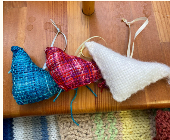
Pin loom squares made into birds - 4x4" loom, plain weave. Beverly Anglin