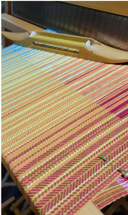
These orange towels are off the loom and waiting to be hemmed.