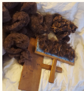
Partially carded 4 oz. bag of Gulf Coast native wool on refurbished cotton carders. Sarah Pair